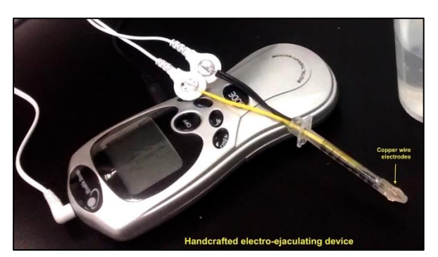
Figure 1. Illustration of the manufacture of the handcrafted electro-ejaculating device

An electroejaculation device was crafted for a continuous electrical current input of 110 V. The device was constructed with a 1 mL insulin syringe (6.0 cm in length and 0.5 cm in diameter) and with three electrodes (two positive sides and a negative central one) of copper wire adapted to the syringe and sealed with varnish. A rocker switch, a current transformer for 110 to 9 V and a conductor for an intensity of 1 ampere were used. The device converted direct current into alternating current, attenuating it to a range of 9 to 12 V. This transformation into alternating current was necessary to make the cloacal probe functional (Figure 1).